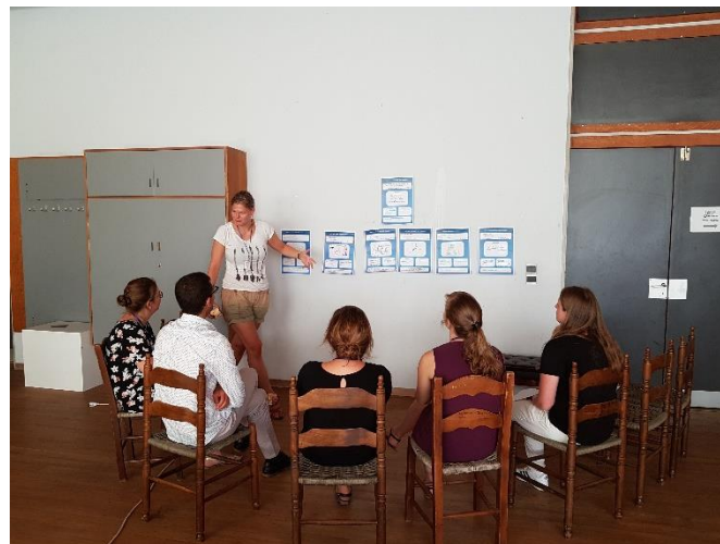
The early career researchers explaining their research projects

Before the start of the 5 th IASSIDD Europe Congress in Athens, the SIRG PIMD early career researchers and senior researchers gathered during the ECR meeting. We started the day in the conference hotel and walked together to the venue of the ECRM: the Athens Conservatoire. There, we had an introduction round and we divided the participants in two groups: the seniors prepared an observation workshop with tips & tricks for the afternoon and the early career researchers had time to get to know each other and each other's research projects using posters. They all drew a picture representing their research project to talk about their research in an informal way.