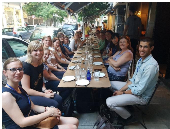
Social dinner of the Early Career Researcher

To conclude the ECRM, there was a social dinner on the 18 th of July to get to know each other in an informal way.